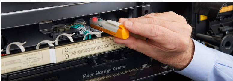
Determine if a port is live. Small size makes it easy to access cramped patch panels.